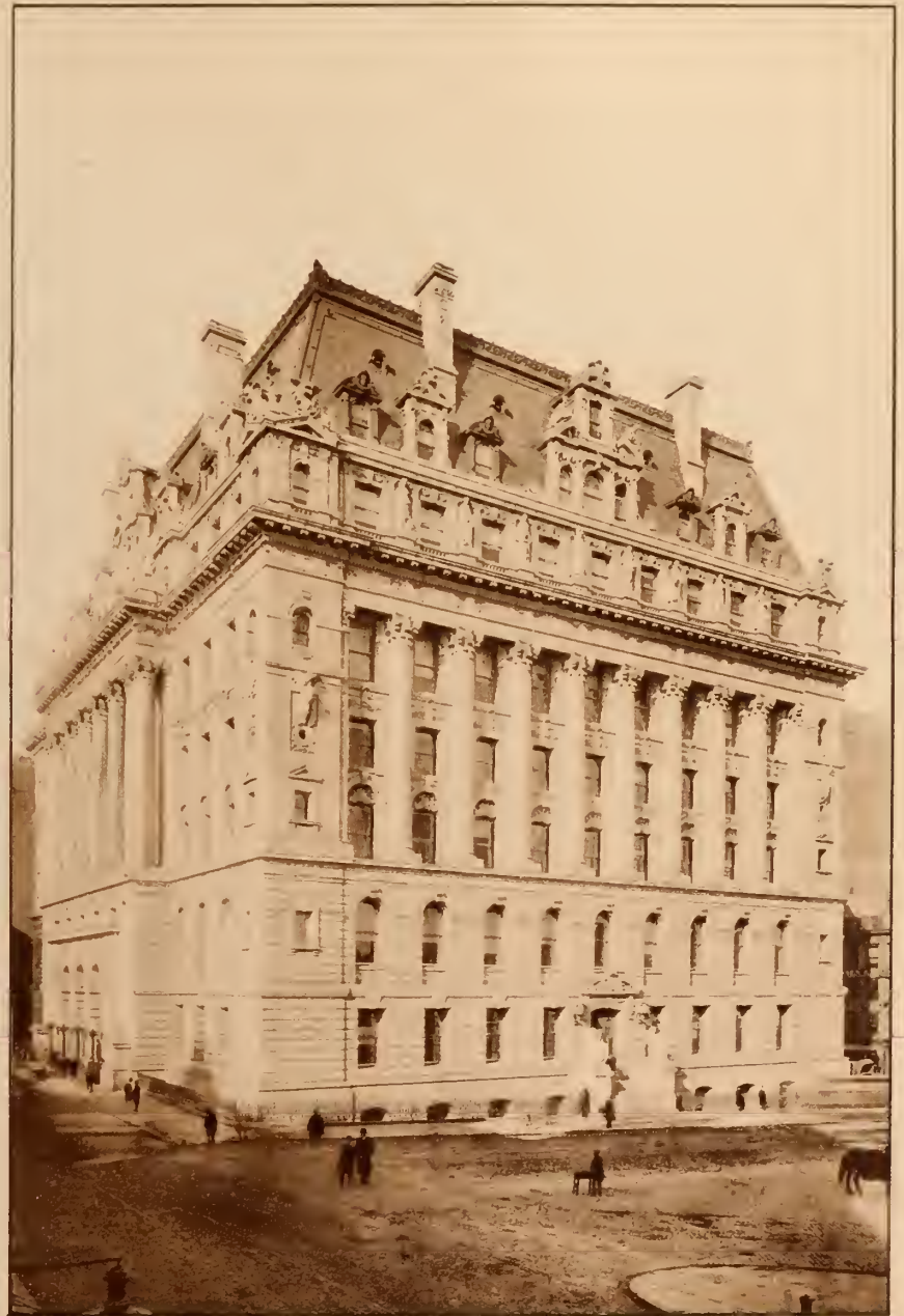
HALL OF RECORDS, housing the County Clerk and real-estate records of the city.